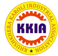
KHUSHKHERA KAROLI INDUSTRIAL ASSOCIATION